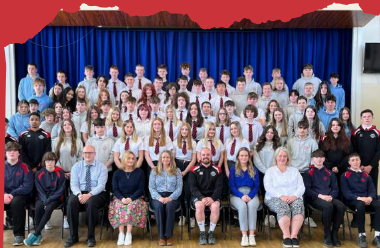
Ysgol Calon Cymru Year 11 2022