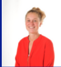
Designated Safeguarding Officer Prif Swyddog Diogelu