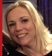
Deputy Safeguarding Officer Dirprwy Swyddog Diogelu Head of Campus