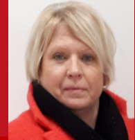
Behaviour Support Officer Swyddog Cefnogi Disgybliaeth