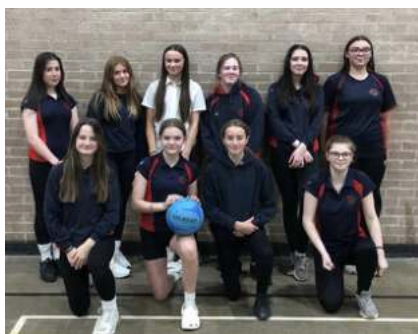
Under 14's Netball team