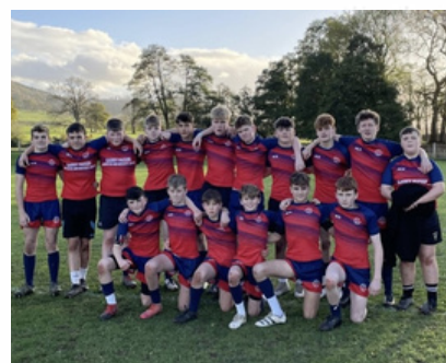
Under 14's Rugby Team