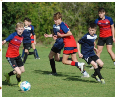
Under 14's Boys Football