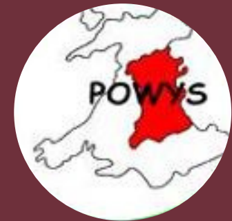
Gwasanaeth Cyfiawnder Ieuentid Youth Justice Service