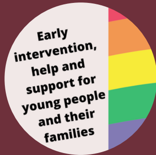
Gwasanaeth Ymyrraeth Youth Intervention Service